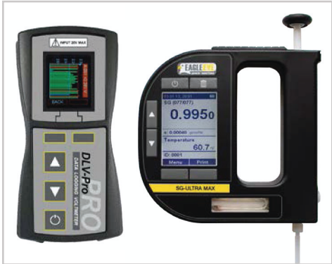
DLV-Pro Voltmeter & SG-Ultra Max Digital Hydrometer